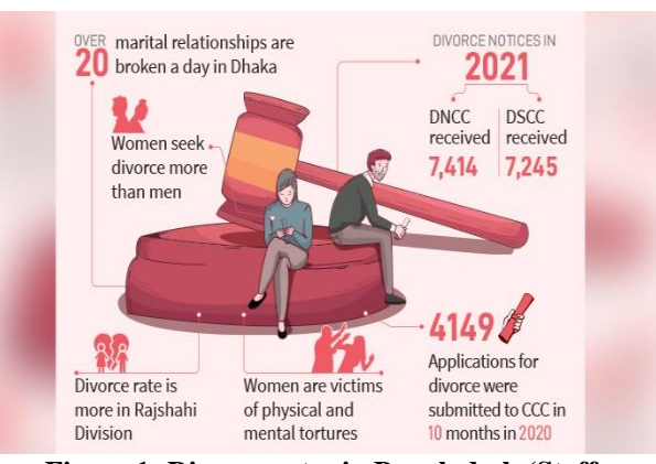
Figure 1: Divorce rates in Bangladesh (Staff Correspondent, 2022).

In this section, the findings will focus on the statistics and trends around divorce in Bangladesh, which are to be compared with the UK. Other data focusing on explaining the stats will also be presented. Figure 1 below summarizes divorce rates in Bangladesh: