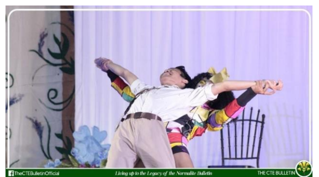
Figure 24. Jester doing comedic movements with an audience

Audience Participation. The play in Ilocos Norte involves a call to the audience, inviting them to join in the festivities and be part of the performance. This communal engagement fosters a sense of unity and shared experience.