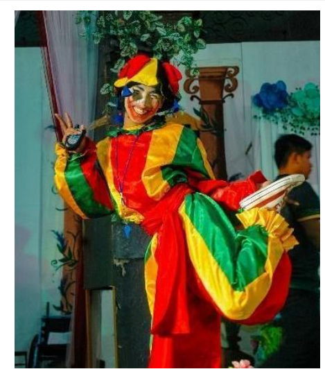
Figure 31. Jester 2 of Ilocos Norte

Family of Christians . These characters play a supportive role in the prince's decisions.