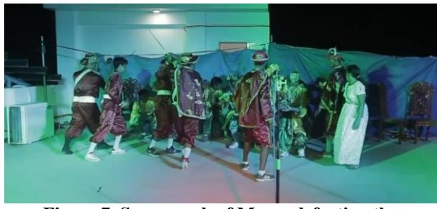
Figure 7. Screengrab of Moros defeating the Christians

The analysis shows that Comedia plays between Ilocos Norte and Ilocos Sur showcase a shared dramatic language that employs intense confrontations where heroes, often portrayed as virtuous and guided by faith, face off against antagonists. This supports the idea of Chase (2023), who discussed that the climax is the point of greatest tension or drama, where the central conflict is resolved. Daisie (2023) also discussed that confrontations in the climax are key moments for character development where characters may undergo significant transformations, make critical choices, or reveal hidden facets of their personalities. This development adds depth to the characters and contributes to a better understanding of their motivations and arcs. Moreover, Deveaux (2019) stated that confrontation creates tension and suspense, holding the audience's attention and keeping them engaged in the unfolding