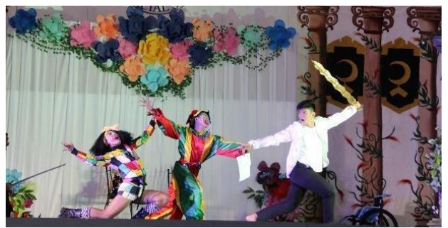
Figure 12. Jesters supporting the prince

Confidant/e. The confidant/e in both of the Comedia plays are clowns or jesters. They are typically the sidekicks that provide moral support and counsel to the protagonist.