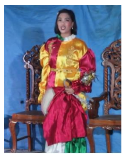
Figure 36. Screengrab of Jester of Ilocos Sur

Clown or Jester. Unlike the play in Ilocos Norte, the play in Ilocos Sur only has one clown, or jester.