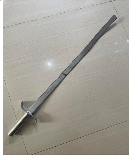
Figure 55. Long sword of Ilocos Sur