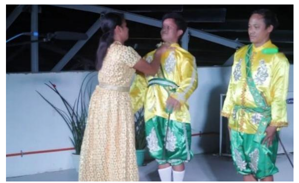
Figure 23. Characters of Ilocos Sur doing comedic movements

The analysis revealed that the movement and choreography of Ilocos Norte and Ilocos Sur are likely to be characterized by a combination of dance forms, expressive gestures, and dynamic interactions that add depth and visual interest to the storytelling process. Hurwitz (2021) discussed that dynamic movement and choreography create a visually engaging spectacle for