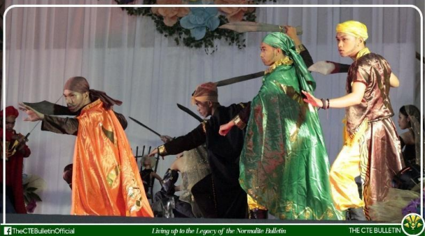
Figure 6. Confrontation between Christians and Moros