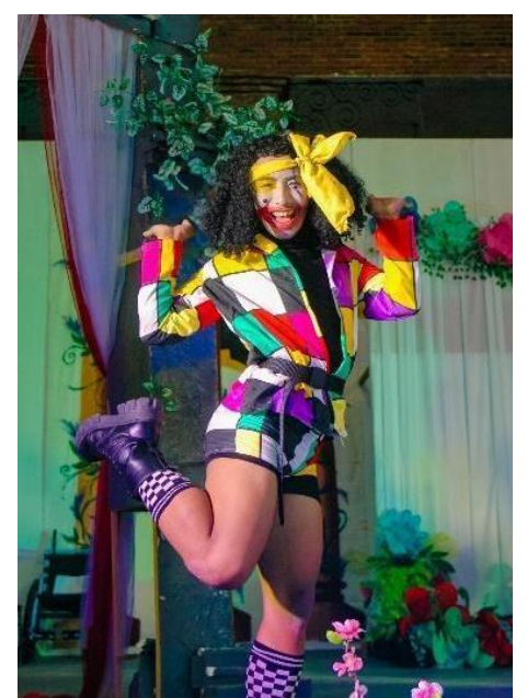
Figure 30. Jester 1 of Ilocos Norte

Two Clowns or Jesters. The clowns, or comedic characters, are often referred to as alalay or comico . These characters provide comic relief and add humor to the performance. They play a vital role in entertaining the audience with their witty lines, physical comedy, and humorous antics. Jesters are known for their exaggerated personalities, costumes, and antics, and these characters contribute to the overall lighthearted and entertaining atmosphere of the play.