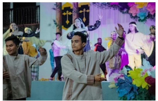
Figure 20. Dance sequence of Ilocos Norte

Dance Sequences. Both provinces included dance sequences, as they are an integral part of Comedia plays. Choreographed dance sequences are often included, featuring traditional or stylized dance forms. These dances add a visual spectacle to the performance and are closely coordinated with the live music.