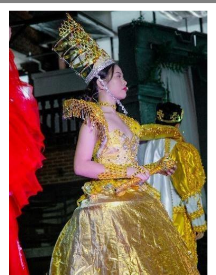
Figure 34. Queen of Christians

Family of Moros. These characters are often responsible for forbidding the love affair, adding tension to the story.