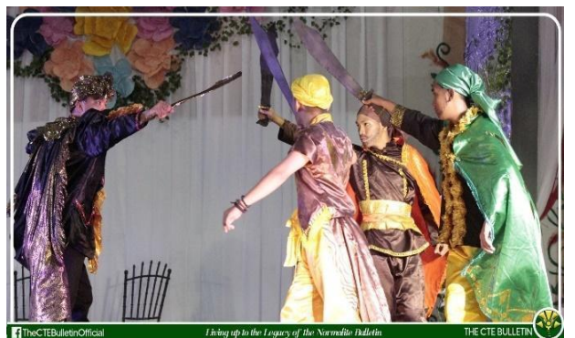
Figure 3. Moros planning to exploit the forbidden love of the prince and princess