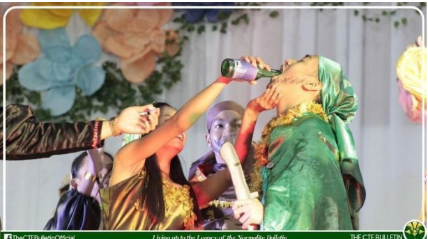
Figure 52. Comedic props used in Ilocos Norte

Comic Props. Props used by the jesters for entertainment.