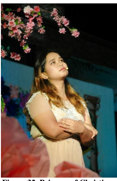
Figure 32. Princess of Christians

Family of Christians . These characters play a supportive role in the prince's decisions.