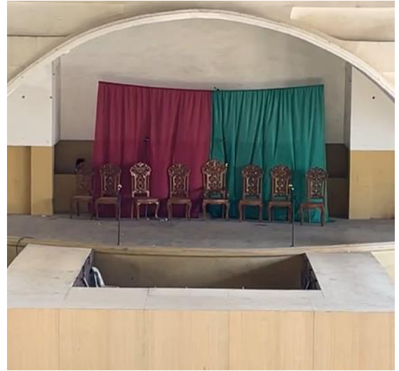
Figure 63. Set of Ilocos Sur

Scenery in Ilocos Sur. The whole background of the play is a curtain that changes color depending on the scene. All scenes were done in the same background