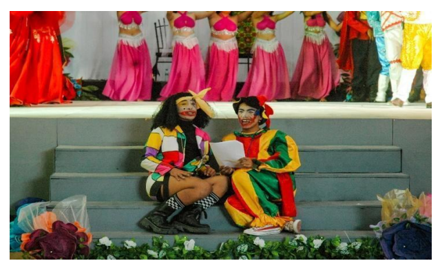
Figure 14. Jesters of Ilocos Norte

provide moments of levity in the midst of the intense drama.