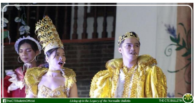
Figure 58. King and queen wearing their crown

Costume/Wardrobe in Ilocos Norte: Color. Christians: White and Gold Moros: Black, Green, and Gold Headpieces King: Golden Crown Queen: Five-stacked Crown