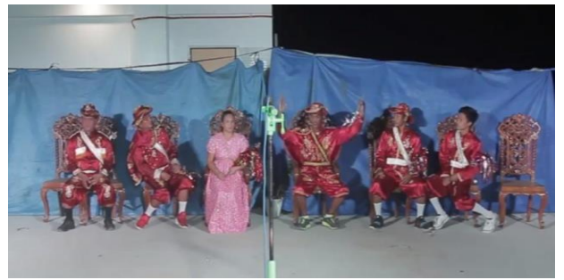
Figure 4. Screengrab of Moros having a meeting for the preparation of the fight

Further analysis revealed the rising action Comedia play of Ilocos Norte and Ilocos Sur follow a hero's journey structure where a central character, often a brave and virtuous individual, is called to embark on a quest to confront a malevolent force of villains. This supports the idea of Shah (2023), who stated that this part of the story usually comprises a series of events that lay down breadcrumbs, ask questions, and set roadblocks and conflicts that must be overcome. It also creates tension and suspense, leading to the third element. Daise (2023) also discussed that a conflict between the protagonist and antagonist creates tension, action, and consequence, and brings great satisfaction to the conclusion of a story. This heroic motif resonates with audiences in both provinces, drawing them into the timeless narrative. While each region may infuse its own unique cultural elements and historical references, the heroic journey of the characters creates a cohesive and captivating narrative structure in the rising action of Comedia across the Ilocos region.