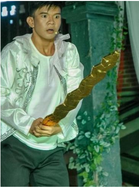
Figure 50. The Golden Sword held by the Prince of Christians