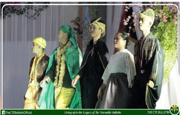
Figure 43. Moro Warriors of Ilocos Norte with the crazy woman.