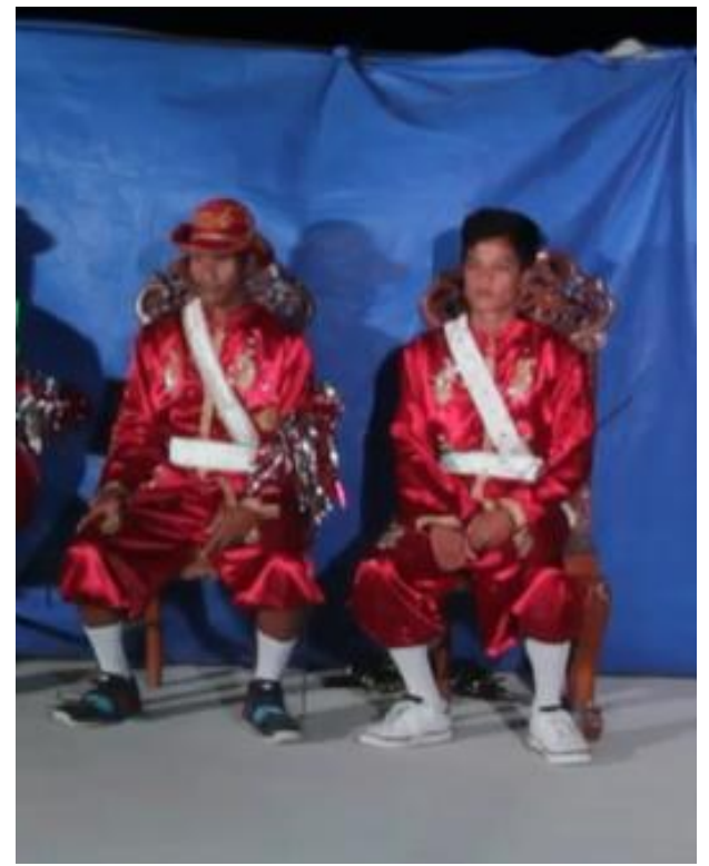
Figure 44. Screengrab of Moro warriors during a meeting for preparation

Moro Warriors . Moro warriors in Ilocos Sur are depicted as resisting Spanish colonization. The conflicts between Moro warriors and Spanish forces in Ilocos Sur contribute to the dramatic tension within the narrative, reflecting historical resistance movements against colonial rule.