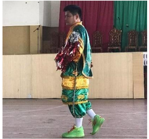
Figure 29. The prince of Christians doing his entrance routine

Antagonist in Ilocos Sur: Prince of Christians. He, along with the Spanish colonial authorities, represents the external force attempting to exert control over the Moro community, attempting to convert them to Christianity and suppress their indigenous beliefs.