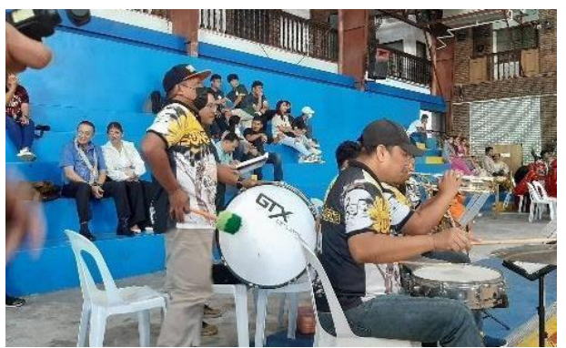
Figure 16. Live band of Ilocos Norte

Live Band. Both plays have their own live band. Hogan (2020) discussed that the live music from the band enhances various aspects of the performance, contributing to the vibrancy, emotion, and cultural richness of performances. Its contributions are vital to the success of the performance, enriching the overall theatrical experience for both performers and the audience.