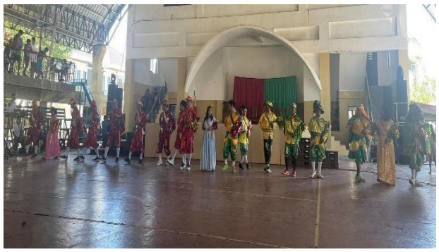
Figure 2. Dance Introductions of Characters in Ilocos Sur

The analysis revealed that the Comedia play of Ilocos Norte and Ilocos Sur has a shared characteristic where both provinces use the exposition as a cultural doorway to introduce key characters with a dance, allowing the audience to quickly identify protagonists, antagonists, and other essential figures. This supports the idea of Fleming (2020), where the exposition shows the part of a story that sets the stage for the drama to follow. This part introduces the theme, setting, characters, and circumstances at the story's beginnings. Hurwitz (2021) discussed how dancing, in the introduction of characters in theater, serves as a multifaceted tool for storytellers. It adds layers of meaning, cultural context, and visual appeal, contributing to a more immersive and engaging theatrical experience for the audience. The parallel use of dancing in character introductions underscores the enduring and cohesive nature of Comedia as a cultural expression in the Ilocos region.