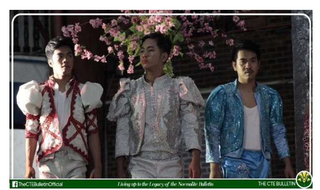
Figure 39. Three Kings of Ilocos Norte

Three Kings or Wise Men. They are traditionally associated with the nativity story in Christianity. These characters are typically portrayed as wise, and noble, and often carry an air of regal authority.