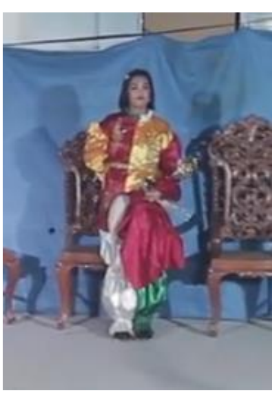
Figure 15. Jester of Ilocos Sur

The similarities in character traits portrayed in Comedia plays between Ilocos Norte and Ilocos Sur emphasize the archetypal nature of characters within the genre. Bright (2022) has stated that characters mainly represent certain morals or qualities and how those morals or qualities affect the plot's outcome. In this study, the portrayal of heroic protagonists, antagonistic forces, comedic relief, and community representations creates a familiar framework that aligns with the moral and theatrical conventions prevalent in traditional folk theater. While each province may infuse its own unique cultural nuances, the universal character archetypes contribute to a cohesive and relatable storytelling experience across the Ilocos region.