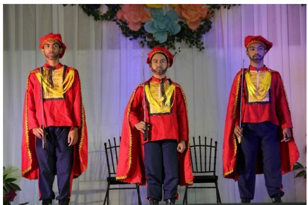
Figure 42. Beard makeup of Ilocos Norte

Beard and Mustache Makeup (Male Characters)