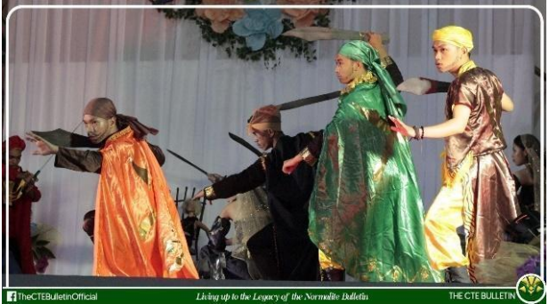
Figures 5 and 6. Confrontation between Christians and Moros