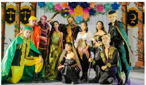
Figure 35. The family of Moros, along with the warriors

Family of Moros. These characters are often responsible for forbidding the love affair, adding tension to the story.