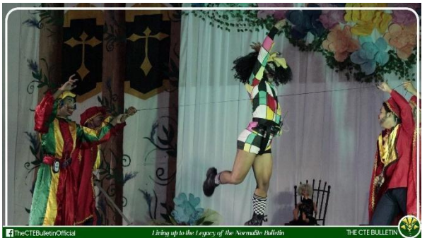
Figure 22. Characters of Ilocos Norte doing comedic movements

Comedic Movements. In both provinces, comedic interactions and physical comedy were involved, including humorous encounters and other playful movements. Some of the characters engage in comedic duels, chase scenes, or choreographed moments of misunderstanding, eliciting laughter from the audience.