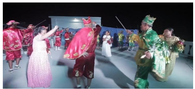
Figure 21. Dance sequence of Ilocos Sur

Entrances and exits. In both provinces, the entrances and exits of characters are stylized and theatrical, contributing to the overall rhythm and pacing of the play. These movements are accompanied by music and serve as transitions between scenes.