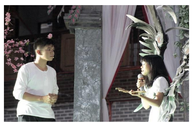
Figure 8. Angel giving the golden sword to the prince of Christians

Falling Action. In both provinces, the falling action serves as a crucial phase where the consequences of the climax are explored, loose ends are tied up, and the resolution unfolds. In Ilocos Norte, the consequences of forbidden love started to unfold when the princess of Moros was kept hidden. The prince of Christians, along with the jesters, then attempted to mediate the situation and successfully resolved the conflict with the help of an angel (Figure 9). On the other hand, in Ilocos Sur, the play explored the consequences of the Moro victory, including the restoration of their autonomy, cultural preservation, and the celebration of their success (Figure 10).