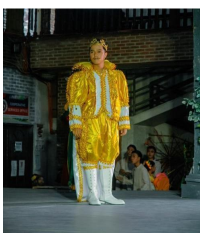
Figure 33. King of Christians