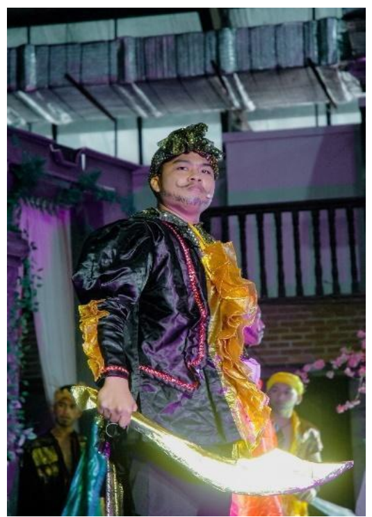
Figure 28. Emperor of Moros during a fight scene

Antagonist in Ilocos Norte: Emperor of Moros. The Emperor is the strict parent of one of the lovers who enforces societal constraints, opposes the forbidden love, or stands in the way of the lovers' happiness.