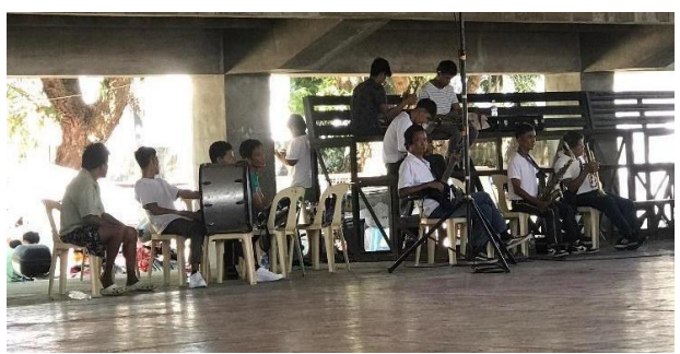
Figure 17. Live Band of Ilocos Sur

ISSN (Online): 2583-1712 Volume-4 Issue-3 || May 2024 || PP. 169-190