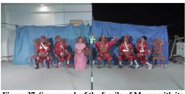
Figure 37. Screengrab of the family of Moros with its warriors

Family of Moros . The family members of Moros play a supportive role in the prince's decisions. They contribute to the emotional depth of the story and provide personal stakes for the central characters.