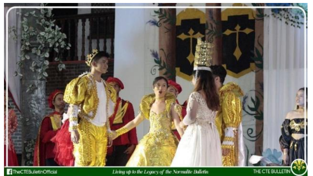
Figure 10. Wedding and promotion of prince of Christians and princess of Moros

Resolution. In both provinces, the resolution typically involves the outcome or solution to the conflicts and challenges introduced in the exposition. In Ilocos Norte, the conflict between Christians and Moros came to an end, resulting in the conversion of Moros to Christianity. The Prince of Christians and the princess of Moros married, became King and Queen, and lived happily ever after (Figure 11). In Ilocos Sur, the play concludes with a resolution of the central conflict, emphasizing the resilience and determination of the Moros. The conflict between Christians and Moros also came to an end. The Moros reaffirm their cultural identity and their commitment to preserving their traditions (Figure 12).