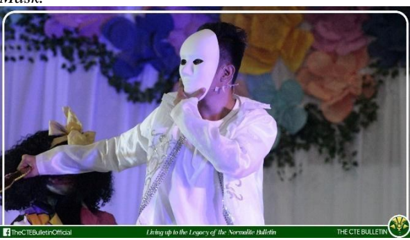
Figure 51. Mask worn by the Prince of Christians

Comic Props. Props used by the jesters for entertainment.