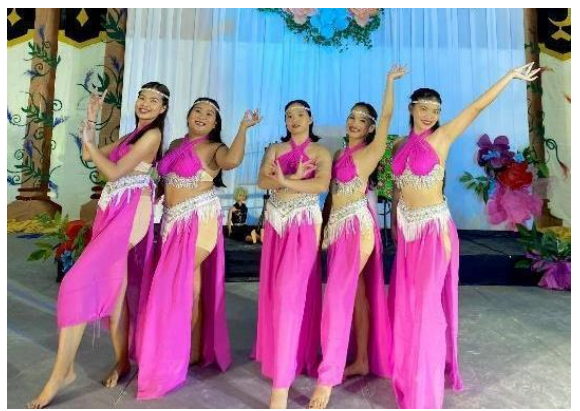
Figure 47. Belly dancers of Ilocos Norte

Dancers. These characters contribute to the visual appeal of the performance. Their movements, choreography, and costumes enhance the overall aesthetics of the production, providing a visually captivating experience for the audience.