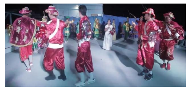
Figure 9. Screengrab of Moros celebrating their success

The Comedia plays between Ilocos Norte and Ilocos Sur share a common narrative structure that addresses the aftermath of the climax and explores the resolution of conflicts. Chase (2023) stated that this part occurs after the turning point of the climax and signifies that the story's main conflict is ending. Ideally, it resolves any loose ends in the plot and shows the aftermath of the climax. Moreover, Daise (2023) discussed that the navigation of the aftermath of intense confrontations and moral dilemmas provides closure to the narrative arcs of the characters. This shared emphasis