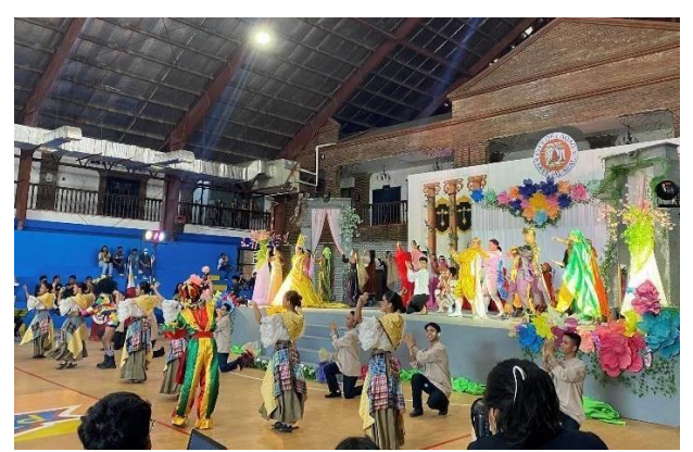
Figure 25. The celebration dance sequence of the play

Festive Atmosphere. While both provinces conclude with a sense of celebration and victory, Ilocos Norte's play includes a more pronounced emphasis on festive elements, such as dances, music, and other entertainments. This joyful ambiance adds a unique flavor to the exposition and climactic moments, setting it apart from its counterpart in Ilocos Sur.