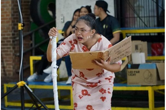
Figure 46. The narrator of Ilocos Norte

Narrator . The narrator in Ilocos Norte plays a significant and multifaceted role, such as storyteller, cultural interpreter, and entertainer rolled into one. The narrator's presence is integral to the traditional and communal nature of Comedia in Ilocos Norte, enhancing the audience's understanding and enjoyment of the performance.