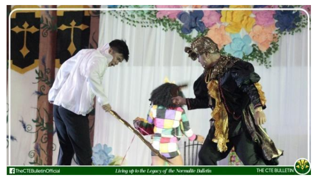
Figure 18. Sword fight of Ilocos Norte

Sword Fighting Choreography. Both plays include stylized fight scenes, especially in situations involving heroes, villains, or comedic characters (Figures 19 and 20). These fights are choreographed to be entertaining rather than realistic, with exaggerated movements and comedic elements.