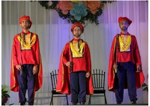
Figure 42. Christian Soldiers of Ilocos Norte

Christian Soldiers and Moro Warriors. They are depicted as participants in the conflicts and conquests. Their roles involve engaging with other characters, including the communities, rebels, or opposing forces within the storyline.