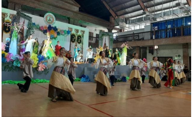
Figure 1. Dance introductions of characters in Ilocos Norte

Exposition . In both provinces, the exposition serves as a ceremonial entry point into the narrative, inviting the audience into the world of the characters. Both plays started with a dance sequence introducing the characters of the play (Figures 2 and 3).