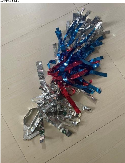
Figure 56. Pika sword of Ilocos Sur

Thrones/Chairs. These props are used to signify seats of authority or formal settings. Thrones, in particular, may represent the seat of a king or ruler.