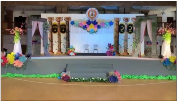
Figure 62. Set of Ilocos Norte

Scenery in Ilocos Norte. The background of the play has incorporated different design elements.