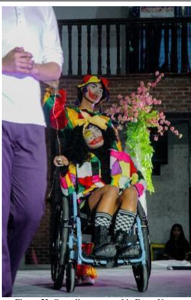
Figure 53. Comedic props used in Ilocos Norte

Festive props. Props used in celebrations and dance routines.