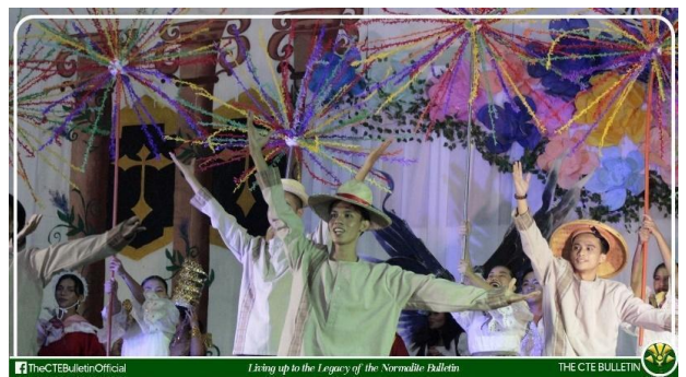
Figure 54. Festive props during celebration sequence

Festive props. Props used in celebrations and dance routines.