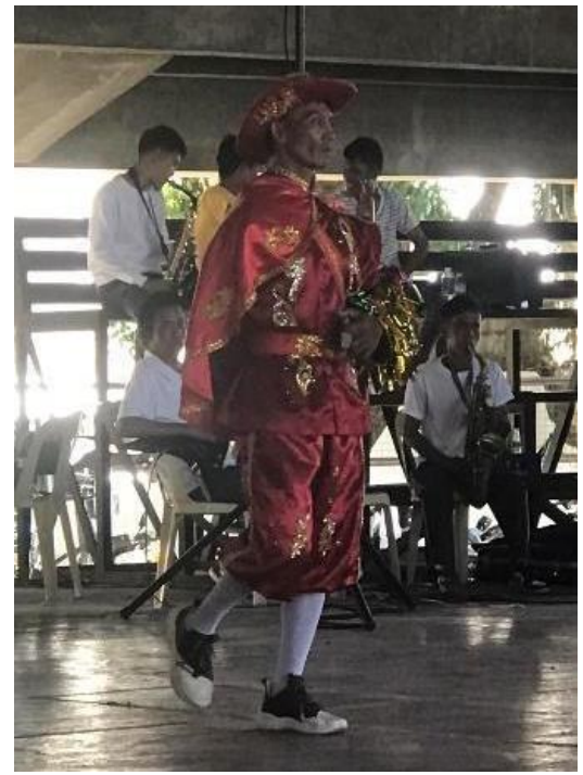
Figure 27. The prince of Moros doing his entrance routine

Antagonist. These characters take on the role of the villain in the story.