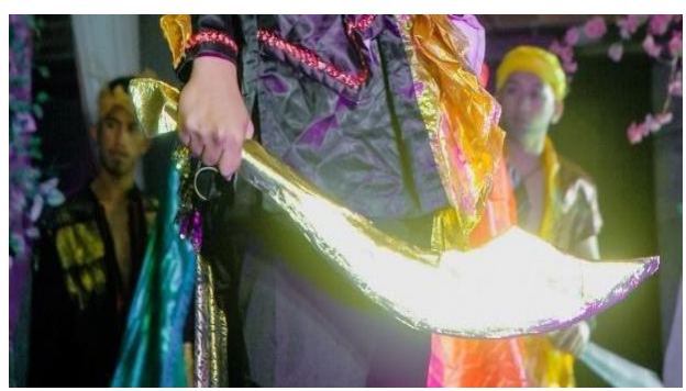
Figure 49. Sword of Moros, held by the Emperor of Moros