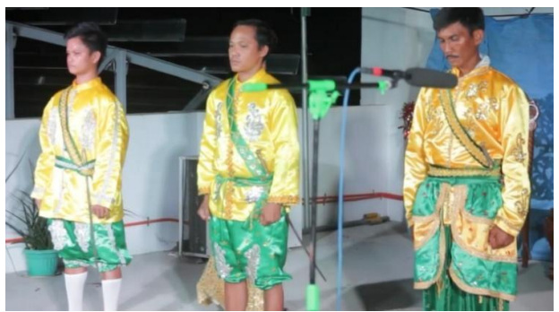
Figure 45. Screengrab of Christian soldiers of Ilocos Sur