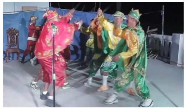
Figure 19. Screengrab of sword fight of Ilocos Sur

Dance Sequences. Both provinces included dance sequences, as they are an integral part of Comedia plays. Choreographed dance sequences are often included, featuring traditional or stylized dance forms. These dances add a visual spectacle to the performance and are closely coordinated with the live music.