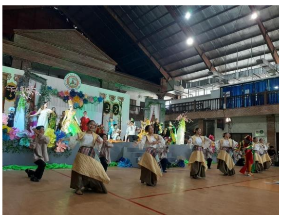
Figure 1. Festival dancers of Ilocos Norte

The analysis revealed that the Comedia play of Ilocos Norte has more characters than the Comedia play of Ilocos Sur. The incorporation of a narrator and additional characters in Ilocos Norte offers a unique lens of the province. Davidson (2023) testified that a narrator establishes a direct connection with the audience, engaging them in a more personal and intimate way. When used thoughtfully, a narrator can be a powerful tool to enhance the theatrical experience and convey the story in a compelling and accessible way. While both plays feature common characters, some of the character's roles differ in each play. These distinctions underscore the adaptability and cultural richness of Comedia in preserving and expressing the heritage of Ilocos Norte and Ilocos Sur.