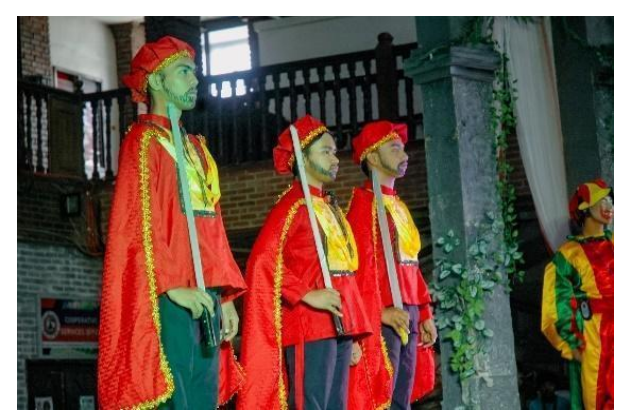
Figure 48. Sword of Christians held by the soldiers