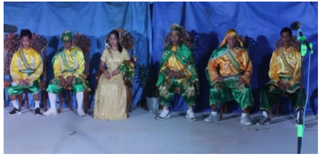
Figure 38. Screengrab of the family of Christians with its soldiers

Family of Christians. They are often responsible for exerting control over the Moro community, adding tension to the story.