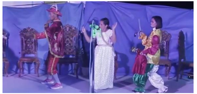
Figure 13. The Jester supporting the Moros

Supportive Family Roles. Both of the Comedia plays play a supportive role in the decision of the protagonist or antagonist.