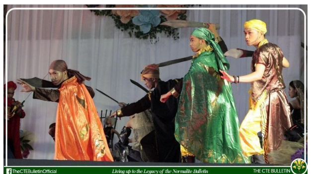
Figure 6. Confrontation between Christians and Moros

Costume/Wardrobe in Ilocos Sur. Color. Christians: Green and yellow Moros: Maroon Headpieces. Christians: King: Green crown Prince of Christians: Yellow veil Soldier: Hat