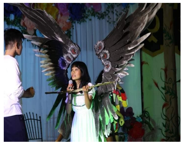
Figure 40. Angel giving the prince the Golden Sword

Crazy Woman . The crazy woman is one of the characters encountered by the prince which hinders him in saving the princess.