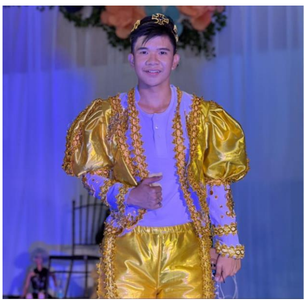
Figure 26. Prince of Christians becoming the King

Protagonist in Ilocos Norte: The Prince of Christians. Typically, one of the lovers is involved in a forbidden relationship. The prince defies societal norms, such as class distinctions or parental disapproval, to pursue forbidden love.