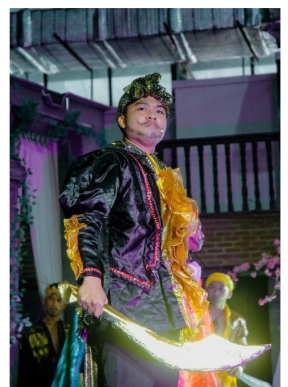
Figure 28. Emperor of Moros during a fight scene