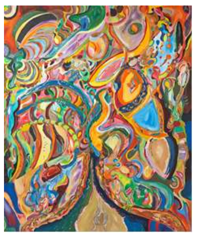
Fig.1. Bernardo Partida, The idea of magic, oil on canvas, 100 x 1120 cm, 2021.

ISSN (Online): 2583-1712 Volume-4 Issue-5 || September 2024 || PP. 31-38