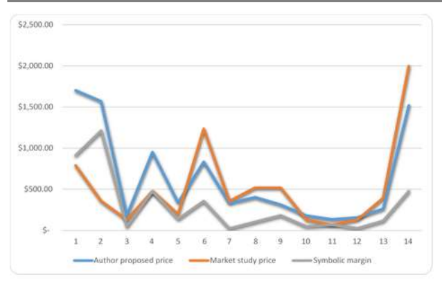
Fig 2. Variations of the different index per artwork at the physical art experimentation methodology valuation.

ISSN (Online): 2583-1712 Volume-4 Issue-5 || September 2024 || PP. 31-38