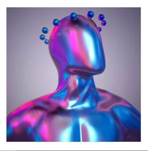
Fig. 3. Rob Dols, Permanence, Digital Art-NFT, 2022. (https://teia.art/objkt/614633).

A young NFT Mexican digital artist / Digital case with statistical experimental methodology