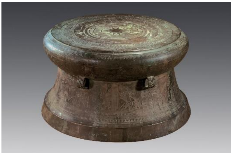
Figure 1: Copper drum (picture from the Internet)

integration can, to a certain extent, enhance students' understanding of folk art in the region, not only make them realize the value of folk art in the region and arouse students' national pride, but also have great significance for the transmission of intangible cultural heritage (Zhang, 2014).