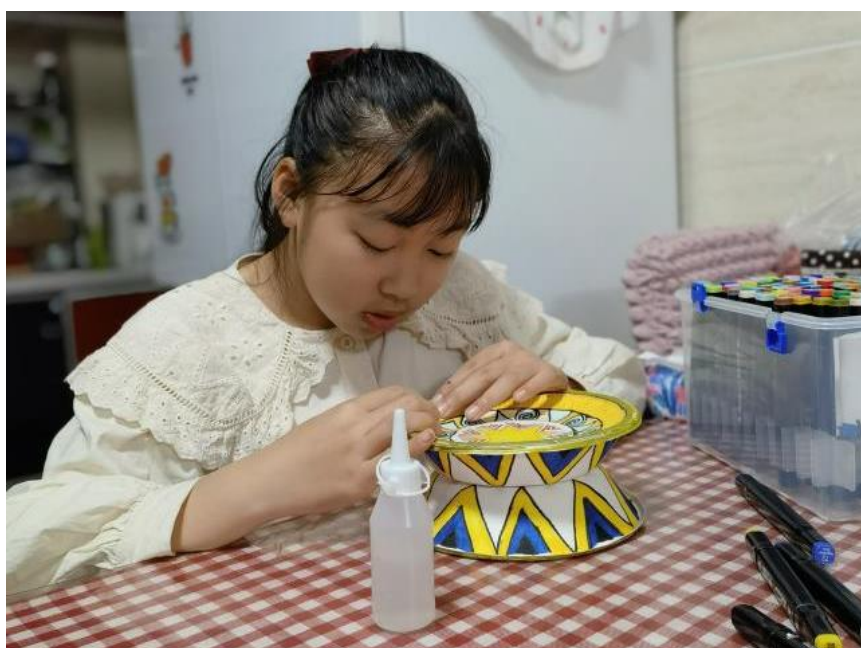
Figure 6: Students making paper plate embroidery balls

teaching, and pass on the traditional copper drum motif patterns in a subtle way (Pan, 2018). In order to better integrate the copper drum motif pattern into elementary school art education, traditional copper drum motif patterns can also be used in the production of handicrafts, especially children's play and teaching aids for elementary school art courses, such as paper plate embroidery balls, paper umbrella paintings, and puzzles.