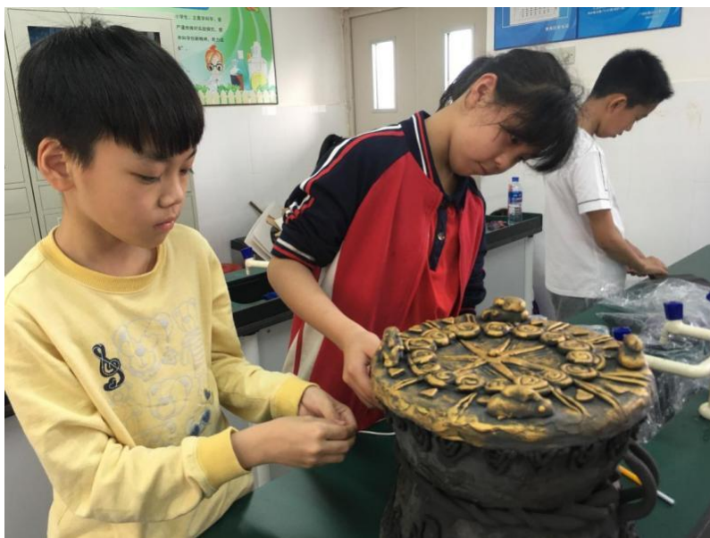
Figure 9: Students are making colorful clay copper drums