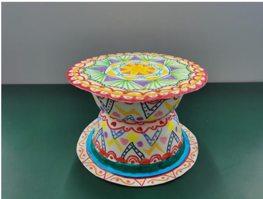
Figure 7: Paper plate embroidery ball

The paper plate embroidery ball (Fig. 7) is made by drawing the pattern of the copper drum symbol in a disposable paper plate with marker, either monochrome or colorful. 3 or 12 paper plates are assembled into the