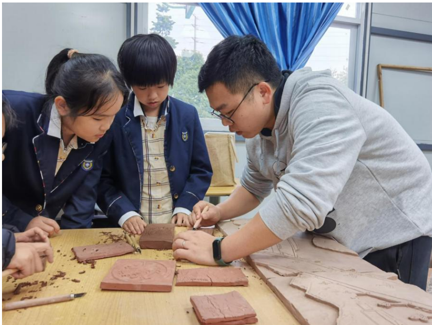
Figure 8: The author is teaching students to make copper drum pottery sculptures

shape of an embroidery ball, which can be made into a single rattle, or threaded with a string, like a string of lanterns, or decorated at the bottom with a thin string as a hanging beard.