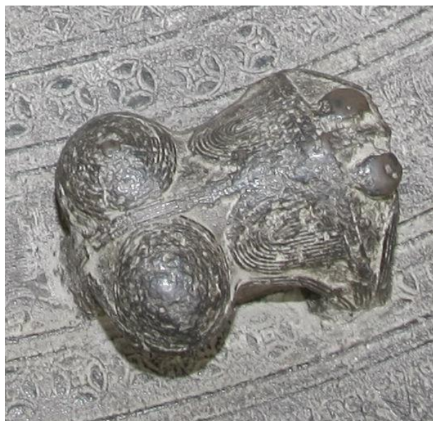
Figure 4: Copper drum frog pattern

The frogs (Fig. 4) are one of the most characteristic decorations and are carved in three-dimensional relief, with a common number of eight. Some of these frogs are facing the center of the drum, some are facing the center of the drum, and some are rotating in one