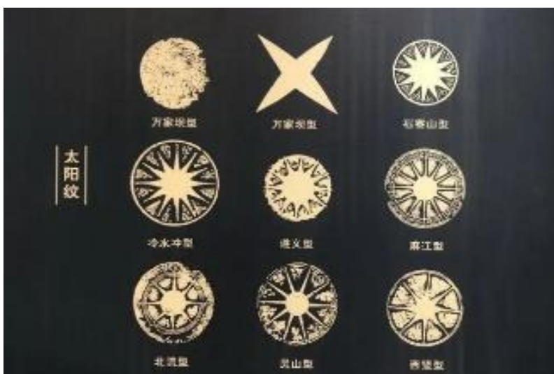
Figure 2: Copper drum sunburst (image from the Internet)

The copper drum pictorial decoration expresses their life scenes on the one hand, and their unique aesthetic sense on the other, which is rich in romance. The decorative patterns of copper drums include sun patterns, cloud and thunder patterns, feathered man patterns, athletic patterns, rowing boat patterns, swimming flag patterns, soaring vulture patterns, geometric patterns, etc. (Li, 2020).