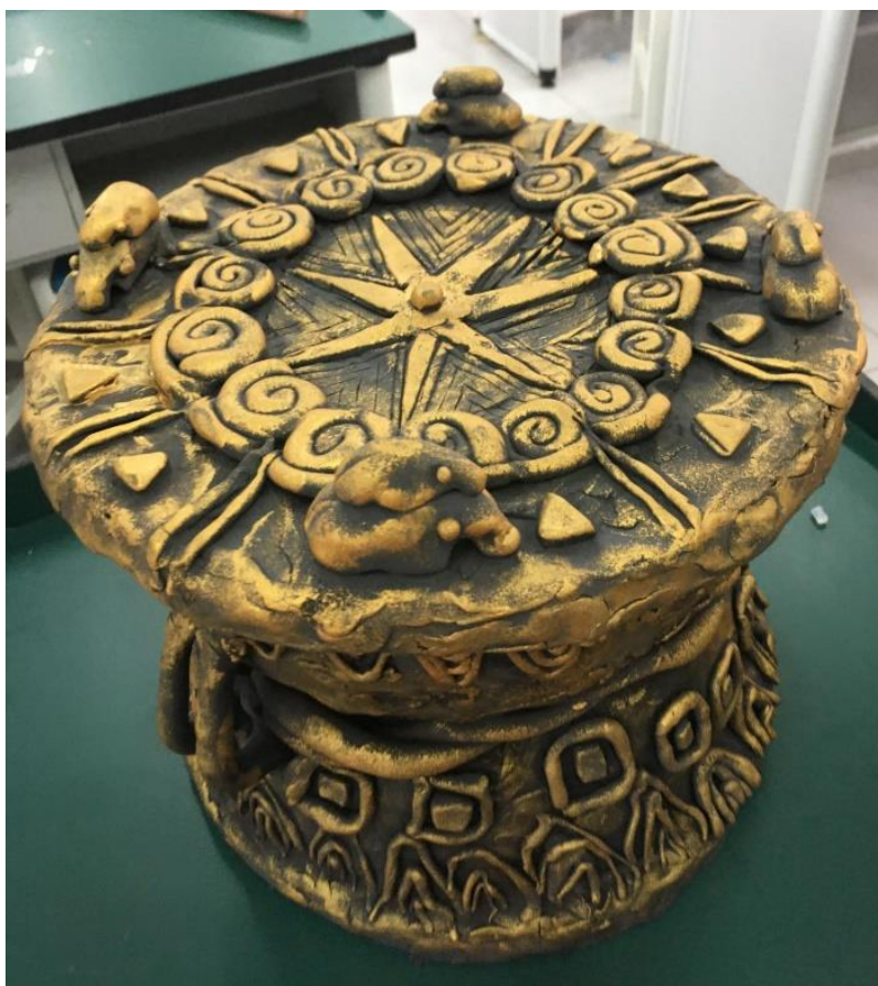
Figure 10: Copper drum in colored clay

Children's playthings are mostly purchased, etc., and lack puzzles rich in national cultural symbols (Li, Tan & Zhang, 2021). To this end, teachers can first connect the bottoms of two pots of the same size together with